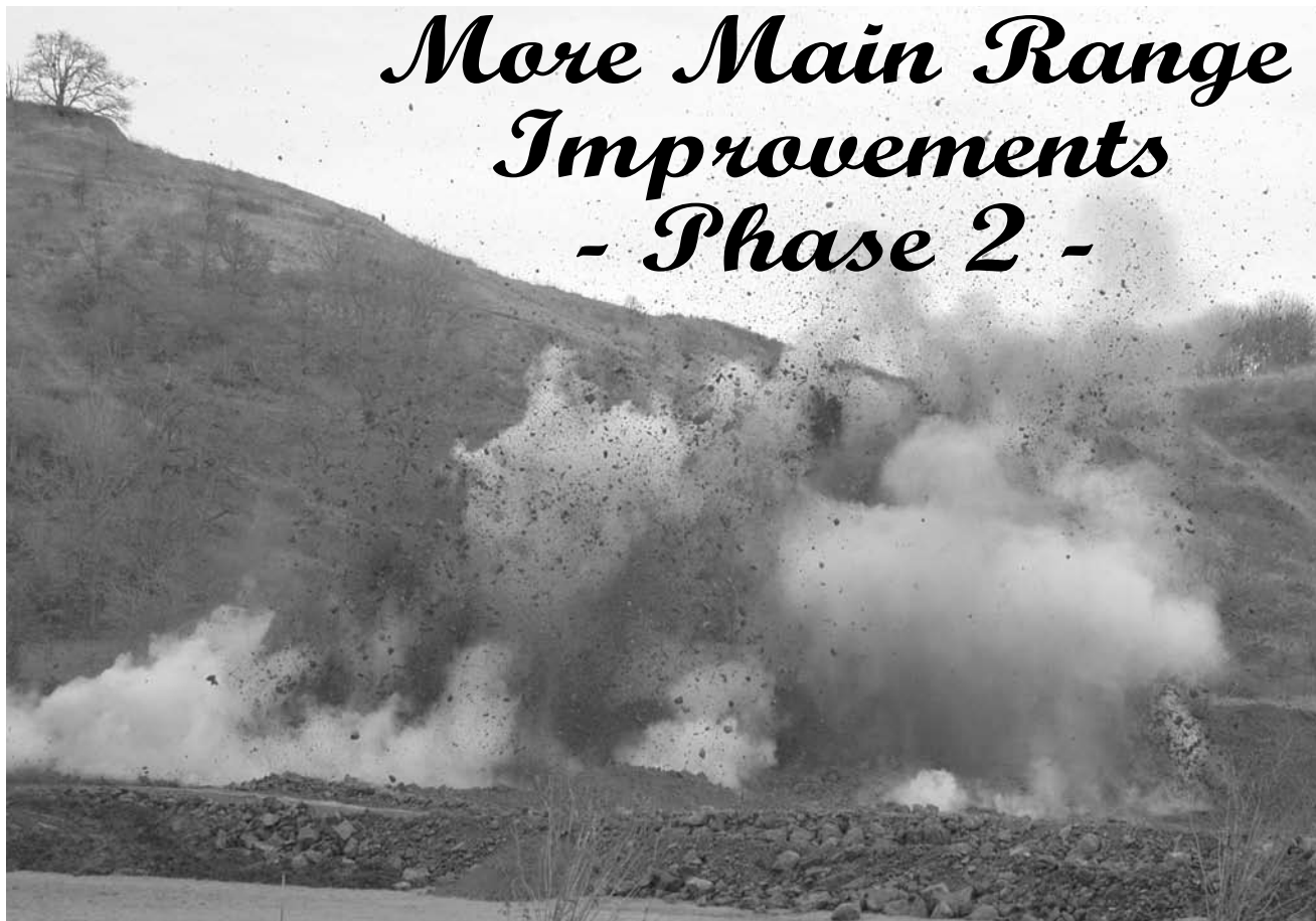
More Main Range Improvements - Phase 2 -

We still do not have the workings finalized for the league shooting, but we are working on it. The other item I am kicking around is a way to get our children shooting. One of the ideas is to not charge, or only charge children half price for them to shoot a round. No charge for instructions,